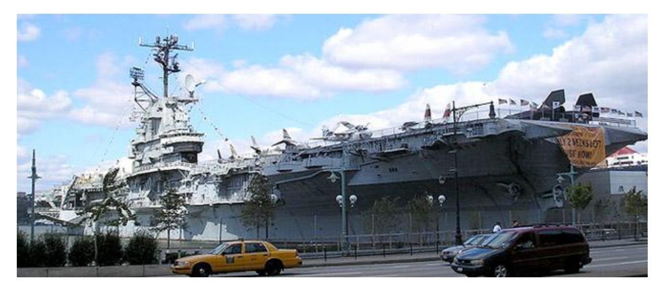
Intrepid Sea, Air & Space Museum

The Intrepid Sea, Air & Space Museum, one of the most unique attractions in New York City, opened in 1982, and is located at Pier 86 at 46th Street on the West Side of Manhattan. The Museum is centered on the aircraft carrier Intrepid, one of the most successful ships in US history, and now a national historic landmark.