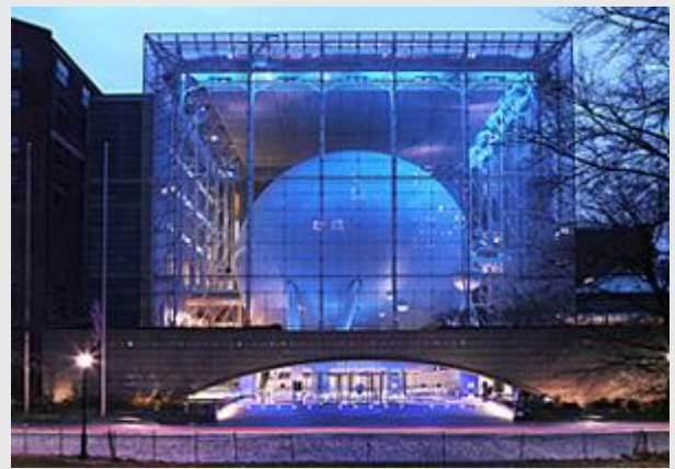
Rose Center for Earth and Space