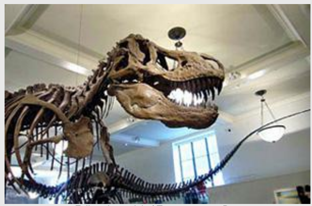
Full scale model of Tyrannosaurus Rex