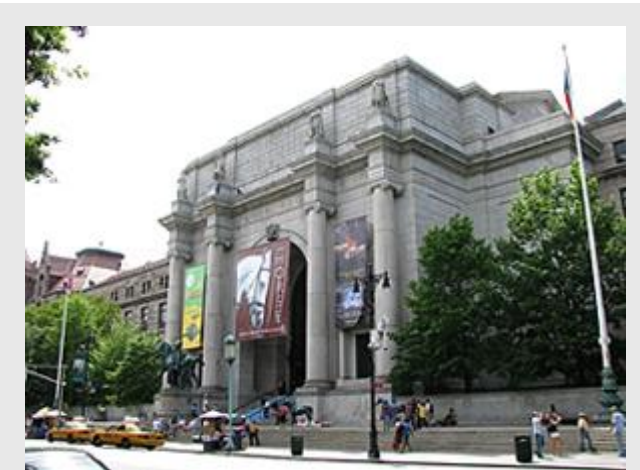
Central Park West entrance