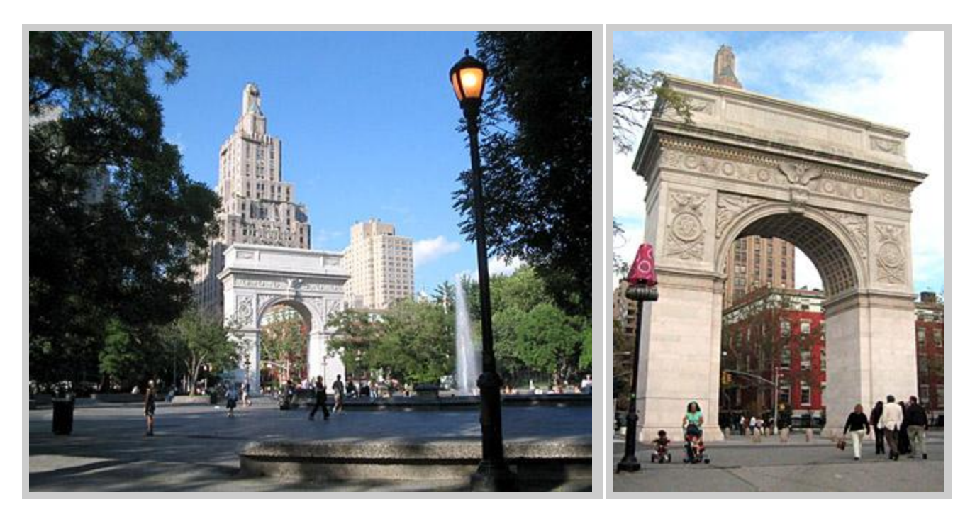
Washington Square Park

Washington Square Park sits at the foot of Fifth Avenue between Waverly Place at its north border and 4th Street at its south, in New York City's Greenwich Village. The park has long represented a tradition of nonconformity, and is a magnet for the bohemian culture that populates Greenwich Village as well as the student population of New York University.